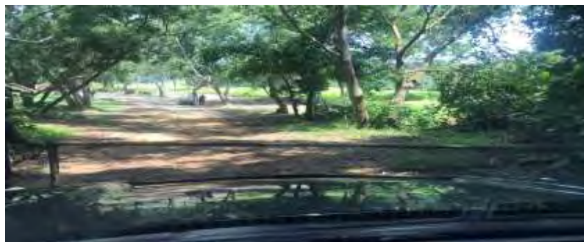
Figure 2. The First Portal of Kampung Baru connecting to Banyan Tree Resort

As mentioned earlier on travel time to and from the village, there are two alternative road access. The first is a dirt road with a travel time of 1.5 hours that cannot be accessed by all vehicles. Notably, motorbike is only can be used in a certain time to go through this road. The second alternative is to go through Banyan Tree Resort area where people must pass two portals. Before getting to the second portal, people of Kampung Baru have to past dirt road with 15 minutes walking or 10 minutes on motorized vehicles.