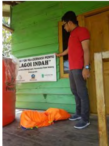
Figure 3. The currently idle Turtle Conservation

Based on the findings, local government does not put the road construction in its agenda. In other word, it does not prioritize the public good provision. This is justified by the fact that the government had chosen to build a small road connecting Kampung Baru with turtle conservation center over building a road opening access for people of Kampung Baru to the main road.