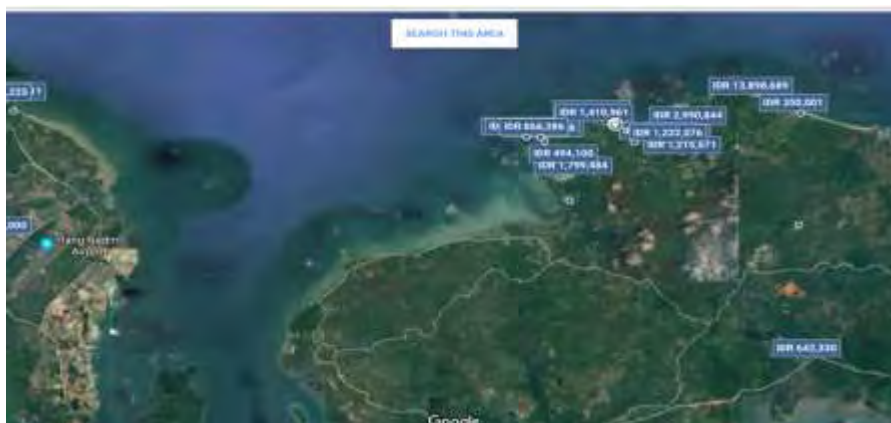
Figure 4. Resorts around the Kampung Baru and their per-night prices

Access to electricity in Kampung Baru is such a contrast to the situation of the surrounded resorts which provide a phenomenal service that come along with fantastic prices. During the FGD, BRC agreed to make Kampung Baru as one of its tourism packages. The idea was to make the Kampung as a window of a rural and traditional settlement (Kampung) which would bring a different nuance of experience to the tourists. Up to 2018, this idea has not been implemented. The failure in implementing this ideas was because there was no third-party facilitating to stimulate the implementation. This would have been a good case for people-government-private sector cooperation.