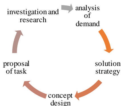
Fig. 2. Generation of concept design process based on issue-guiding

exploitation of needs of the object (Fig. 2). The design concept generated by the problem-stimulating guide can effectively grasp the core of the problem, and then transform the design requirements into problem-solving. For instance, students are required to transform a space filled with column structure in the teaching, and then pillars in the design become "annoying". Therefore, it is significant to put forward problem-solving concept strategy for the "pillar" and creatively deal with the column network in the space to turn "trouble" into a surprise highlight.