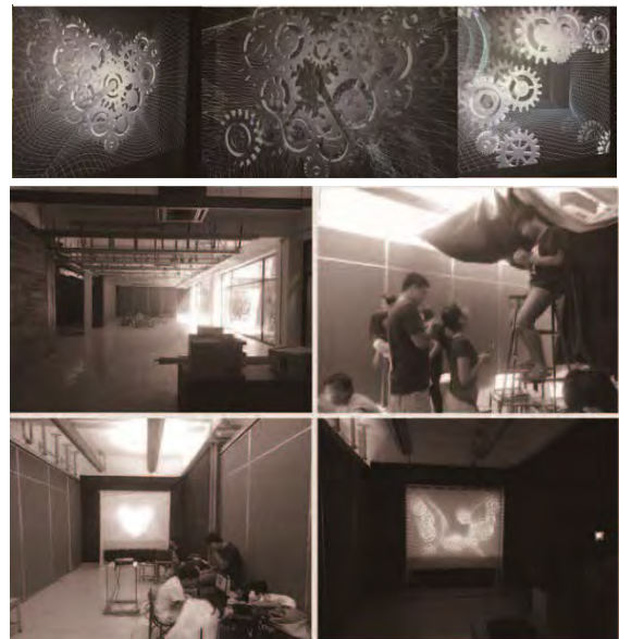
Fig. 4. Time, space and conceptual design of image

theme of the teaching, which aims to express the relationship between space and time through images. Through association and correlation, students establish connection between time and gears and represent the passage of time by the rotating speed of multiple gears through images in a closed space (Fig. 4) [9] .