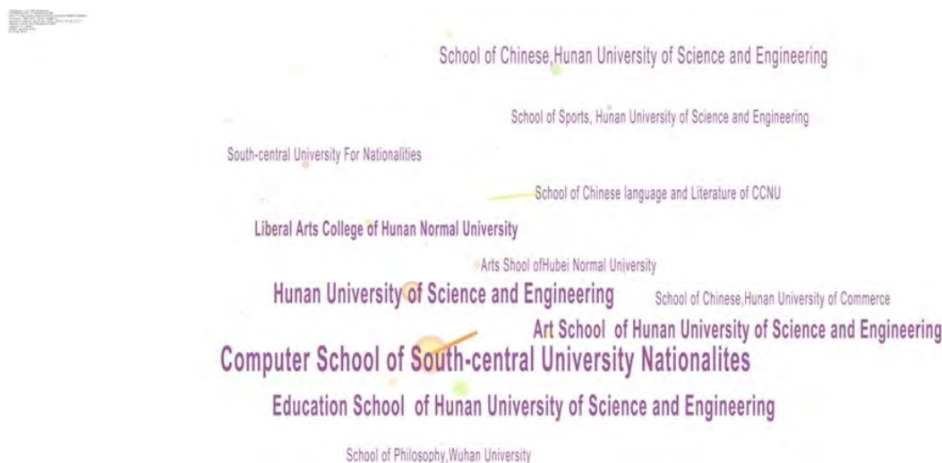
Fig. 3, Nüshu research core institution co-occurrence