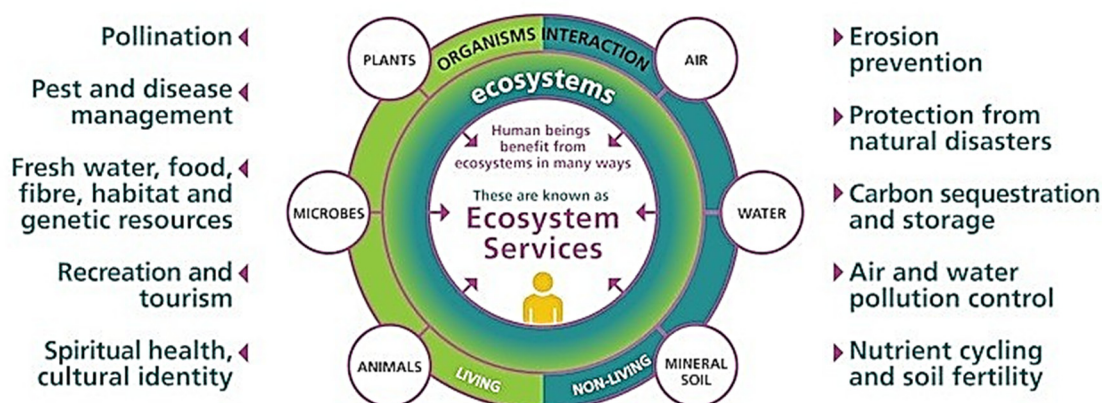
Fig. 2 Relationship between people and society and nature

The natural ecosystem composed of humans and various organic and inorganic substances is an organic whole that depends on each other and interacts with each other. People are one of them, paying attention to the regeneration of nature. Nature is the material basis of human life. For human beings to continue to survive and develop, it is necessary to transform the natural world and engage in production activities. However, the resources of nature are limited, and many resources are non-renewable. As the scale of production expands, the extent and extent of human damage to nature will continue to deepen. If this trend can develop, it will inevitably break the balance and stability of the entire natural ecosystem and directly threaten human survival and development.