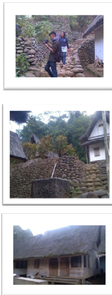
Fig 1. Terracing made from stone and home architecture.

Kampung Naga community still keeps their custom, especially in maintaining their environment. Because Kampung Naga has a large slope, there are terracing that separate one group of community with another group. There are almost 6 terracing, and each terracing consists of 12 to 15 home. The clift of terracing is 2 meter high, and it is made from stones which are neatly arranged with natural layout and material. Moreover, there are stones in the edge of the river to prevent vertical eruption and flood. All of these things become the typical characteristic of architecture in Kampung Naga.