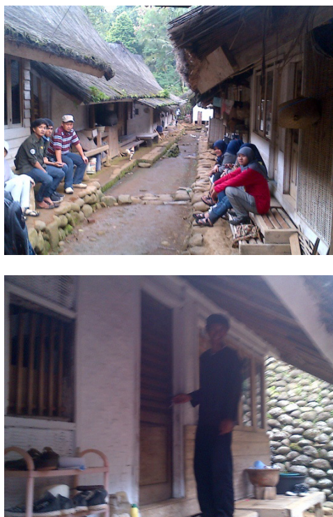
Fig. 3 Neighbourhood