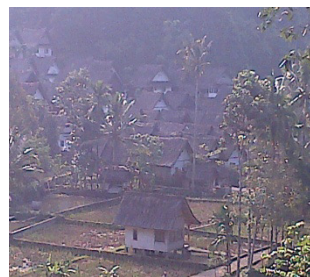
Fig 2. Spatial Planning and River as the Preventive Way from Vertical Eruption.