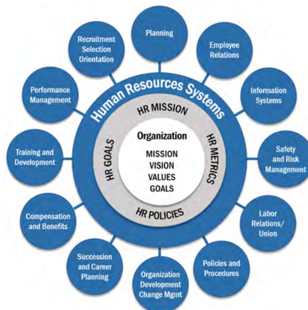
Figure 1. function diagram of hospital human resources department