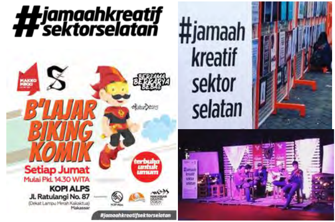
Fig. 5. Visualization of " #jamaahkreatifsektorselatan " hashtag on publication and documentation media.

The third stage of the campaign and creative communities branding is the introduction and promotion of the hashtag campaign #jamaahkreatifsektorselatan as a collective creative movement on social media. This promotion began by introducing the visualization of this hashtag on the publication tools, documentation activities, and making an image before uploading to be posts on social media. Arrangement and visualization of #jamaahkreatifsektorselatan hashtag on several media including: (1) put on sponsors area in the publication materials with supporting sponsors logos; (2) made in standing banner and photographed with exhibition material as a documentation; (3) acknowledgment of posters and banners; (4) posted as images on social media; and (5) included as a hashtag on captions on social media.