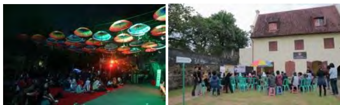
Fig. 2. Community mapping through discussion and art exhibition titled "Nostalgia" in Benteng Rotterdam Makassar and at "Konser Musik Imam Mozart" at UKM Seni parking court of UNM Kampus Gunung Sari.

From these various mapping activities, a preliminary analysis was found that these communities were able to work together with each other. The creativity of each community is differently, by collaborating, a working system is generated that covers each other's shortcomings. Thus the chances of achieving the objectives of a movement are more easily achieved, especially in activities that are part of the creative economy development. According to Bonatti, teams and partnerships perform an important role in economic implementations at the individual and corporate level. In a collaboration-based activity, the success responsibility is shared equally among all members involved [7]. This makes the collaboration method in the implementation of art activities in this region become possible to continue to be implemented.