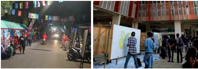
Fig. 1. The atmosphere of Mangasa Village Art Festival and Mural Activities in OrangeFest 2016.

In addition to the two events highlighted above, the mapping of the creative community was also carried out by inventing a collaborative works for among fellow communities, including: (1) Collaboration by students of Visual Art education FSD UNM FSD with the LaborArtorial community organizing an art exhibitions titled "Nostalgia" in Galeri DKM Benteng Rotterdam Makassar; (2) Collaboration between UKM Seni UNM and Balanipa Project at Imam Mozart Mini Concert in UKM Seni UNM court; (3) Collaboration of DKV FSD UNM and BKMFMimesis with Rumata Artspace on "Ruang Bersama" Installation at Makassar International Writers Festival (MIWF) 2017; (4) Collaboration of Visual Communication Design Dept. FSD UNM, Visual Art Education Dept. FSD UNM, Mahakarya Kreatif Nusantara and Pusat Kewirausahaan UNM (UNM Entrepreneurship Center) carrying out the final assignment study exhibition at La Macca UNM Hotel Court.