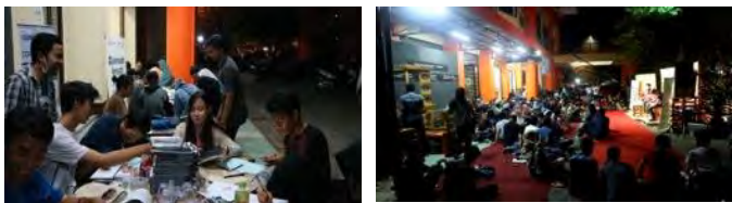
Fig. 4. Community meet up at La Macca Creative Corner.

In addition to the activities described above, as an entrepreneurship laboratory and community economic development space, La Macca Creative Corner also manages MisterDaeng , an indigenous comic character for Makassar, a photography studio named Mahakarya Photography and Square and Mahakarya Advertising as a graphic design agency. At this stages, all activities at La Macca Creative Corner become the major node for the creative branding campaign Jamaah Kreatif Sektor Selatan .