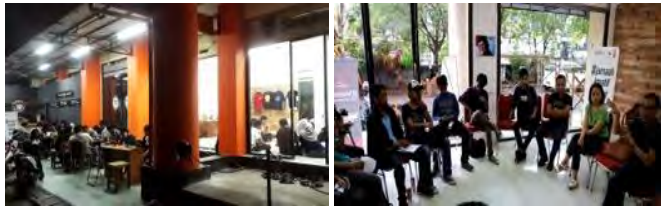
Fig. 3. Community atmosphere and discussion at La Macca Creative Corner.

Observed from creative economy perspective, Grodach suggested that increasing of social interaction in an art space resulted in economic revitalization [11]. He argues that the ability of the art space to create a creative economy is related to its role as a public space and community hub. More attention to the art space and creative hub can expand the potential for community development because habitually the ability of individuals to appear in public spaces is obstructed by the design of facilities and connections to the surrounding environment. This problem is overcome by providing special art spaces for communities, art galleries and art centers that can be accessed by the public.