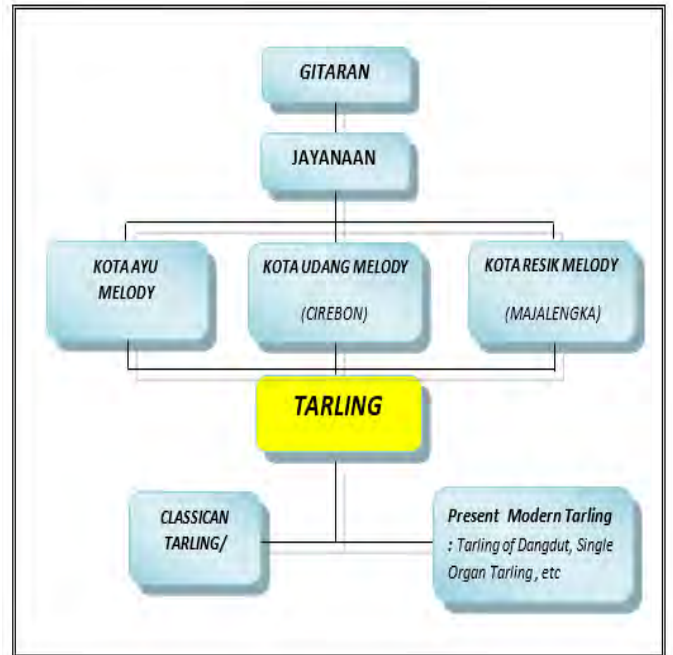
Fig. 2. Tarling Plot of the development and name based on the explanation given by Sunarto Martaatmadja [4].