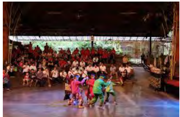
Fig. 5. Learning with art.

This learning stage needs to be considered also in the arts education tourism activities, to foster students' understanding of the values contained in a work of art. Understanding these values will eventually be able to shape the character of students towards a better relationship with the application of character values that are inherent in artwork to be implemented in daily life.