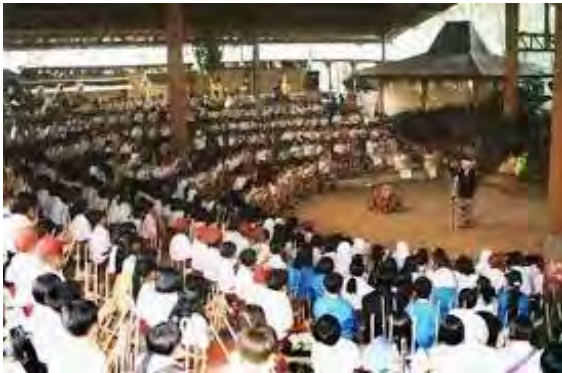
Fig. 3. Learning to appreciate the art.

Learning to appreciate art needs to be considered in the art education tourism activities especially for students. This is to foster student awareness in appreciating ideas and ideas for the birth of artwork from art creators. The value of learning that is emphasized in this process is learning to appreciate the idea of one's artwork to not be duplicated at will. Furthermore, learning to appreciate this work of art is to foster a sense of love for his ancestral culture related to traditional art performance material which is the hallmark of the development of art education tourism material created at Saung Angklung Udjo Bandung-Indonesia. Students must get to know more about the development of their ancestral culture which is manifested through products of traditional performance art, dance and music, and fine arts.