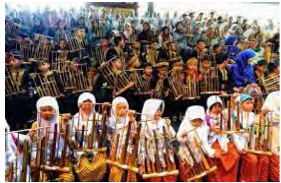
Fig. 4. Learning to do art.

Students need to get experience directly related to learning to do art activities. This is to foster student motivation and interest in learning the art. During this time, they only read more art textbooks, without being directly balanced to gain experience in performing arts activities. In the context of art education tourism activities that were developed in Saung Angklung Udjo Bandung-Indonesia, the participants were invited directly to be able to learn to do art activities such as learning to play angklung and a simple dance to give students direct experience about playing a piece of art such as angklung and dancing together according to the ability of each student to move.