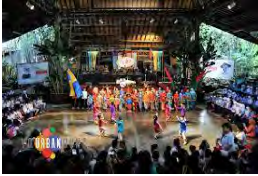
Fig. 2. Learning to observe the art.

on various aspects of presentation elements related to the form and structure of the presentation.