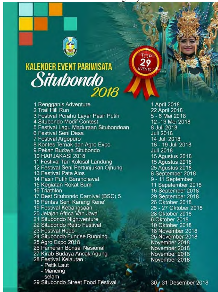
Figure5. Tourism event calendar of Situbondo regency in 2018

reciting Shalawat and hadrah music performance. In 2018, this event is then named Kirab Budaya Ancak Agung as listed in tourism event calendar of Situbondo regency.