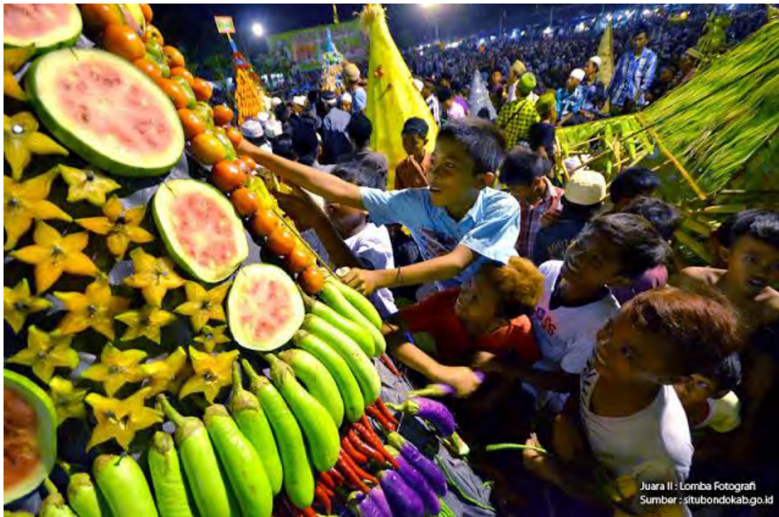
Figure4. Ancak Agung in Situbondo city

Construction of Situbondo branding as Santri city and earth of Shalawat Nariyah is actually encouraged by background of local people's culture who are mostly Madurese people. Speaking about life view of Madurese people cannot be separated from Islamic values, because almost all Madurese people are Muslim (see Wiyata, 2013: 3). Obedience of Madurese people to Islam is embodied-identity important to them. It is manifested in a way of how they dress daily, that cannot be separated to Islamic clothes like samper (long cloth), burqo (veil), sarong and sonko (skullcap) (Rifai, 2007: 446). Besides, existence of Islamic boarding schools in Situbondo regency also encourage people's culture to be cultural Islam. For example, a cultural event in Situbondo traditionally held to welcome Muhammad prophet's birthday is Ancak Agung tradition. It is a kind of celebration tradition by decorating various food in cone form. It consists of fat rice (yellow) with side dishes and yellow janur attributes with various vegetables and fruits. These kinds of foods arranged and ordered in such a way to form beautiful big cone ( tumpeng ) in 1-3 meter size.