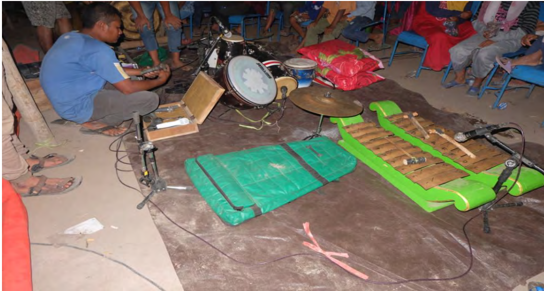
Figure3. Use of Madurese music and Hadraah instruments

characteristics by using local musical idioms, Madurese ethnic instruments and sometimes collaborated with Al Mahabbah hadrah by singing Madurese syi'ir created by KH. Khalil. Here is a documentation of tabbhuwân WSIBS instruments.