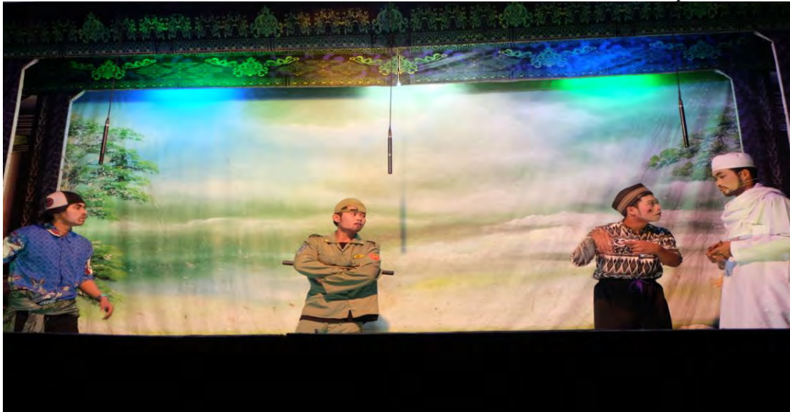
Figure2. Decoration with characteristics of Madurese tradition and Indonesian fashion.

Local term tabbhuwân is used to make it closer to society rather than common term like play. Even if the performance has been adapted to Islamic idiom, tabbhuwân WSIBS does not lose Madurese taste. This can be seen from style and motif of pajhângannya (stage's ornaments), use of Madurese language, performer clothes and Madurese musical idioms. Here some documentations of WSIBS tabbhuwân performance.