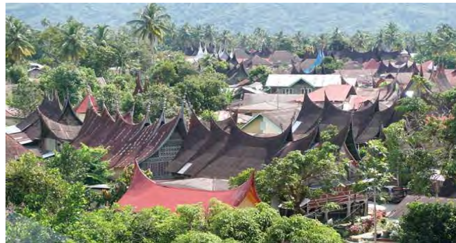
Figure 3 Seribu Rumah Gadang Area Nagari Koto Baru

Traditional houses belonging to these tribes since approximately 2 years ago have become tourist destinations that are now known as Seribu Rumah Gadang Area. In the area, several traditional houses are used as home stays. Tourists who visit there can rent rooms in Rumah Gadang at quite affordable prices. With a price of 200 thousand rupiah per night per head, it includes dinner and breakfast as well as culinary specialties of the Solok Selatan region. At the request of a travel agency that brings tourists to the area, tourists are also treated to various traditional art attractions. Traditional art performances are held at 9-10 am. Of course treats traditional arts that have been packaged for the needs of tourists, who do not have time to watch every attraction they enjoy. Some types of traditional arts that become tourism potentials are presented at that time, including tempurung dance, gandang sarunai , talempong pacik , and randai .