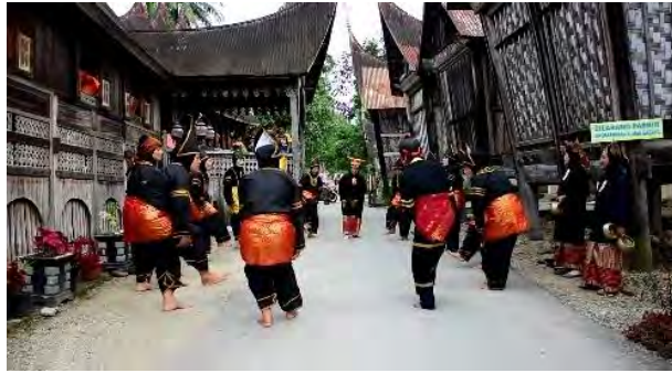
Figure 8 Performing randai packaging art in the yard of Rumah Gadang Gajah Maram Seribu Rumah Gadang Area of Jorong Lubuk Jaya, Nagari Koto Baru, Sungai Pagu District, Solok Selatan Regency (Marzam documentation, July 14, 2018)