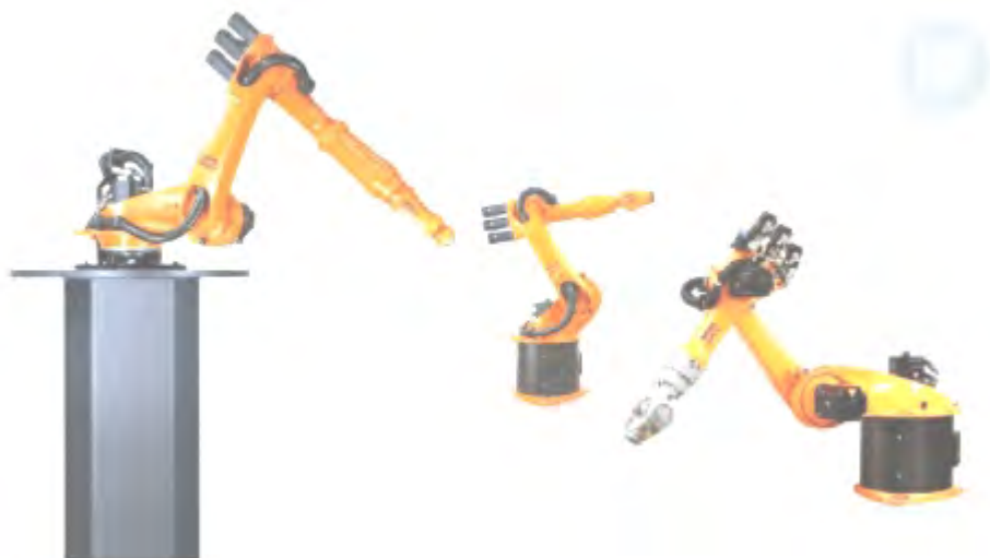
Fig. 2. Industrial robots figure shape.