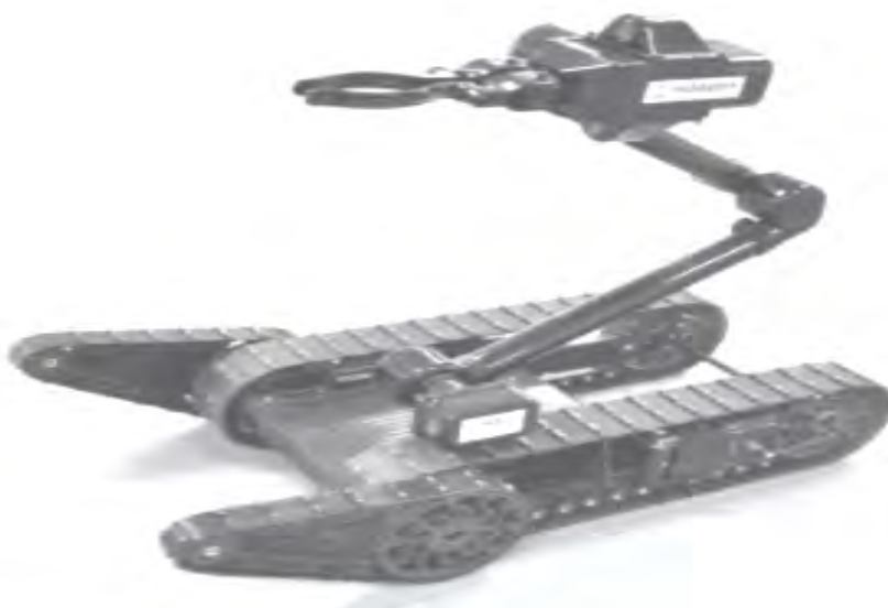
Fig. 3. Special robot appearance figure

The shape diagram of the crawler robot with variable shape is shown in figure 4.