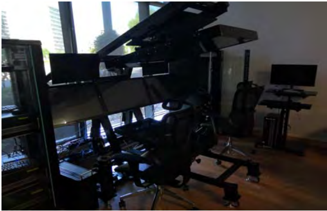
FIGURE II. A OVERVIEW OF DESKTOP-PC BASED FLIGHT DECK HMI SIMULATOR

Additionally, the touch control technology can help the aerospace engineers to carry out basic research and experiment with the new generation of aeronautical HMI design in an experimental environment. The key features of the desktop simulation platform provided are as follows: