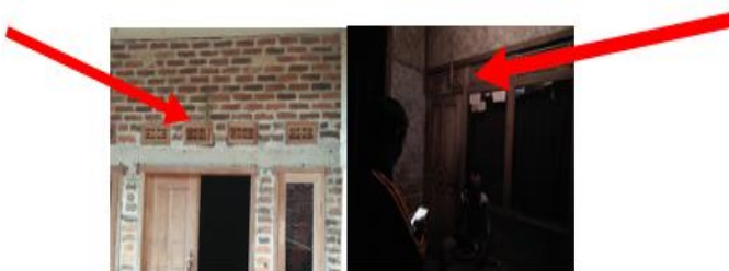
Fig. 1. The symbol of 9 rice stalks.

The symbol used in Kampung Salapan is "9 rice stalks" which means to protect and preserve agriculture. Agriculture is strongly tied to culture [4]. Rice is the as a staple food is the source of life. It also symbolizes the livelihood of the people in Kampung Salapan. The 9 rice stalks symbol is placed in the facade of the house as an expression of gratitude of the people to the creator especially during harvest time. The image below is an example of how the symbol is placed above a doorway of a house in Kampung Salapan.