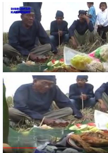
Fig. 4. Upacara Nyalin ceremonial rite.

This ceremony is using offerings such as black coffee, tea, rujak and coconut for the attendance. The dress code for Upacara Nyalin is usually traditional attire of Kampung Salapan, a Sundanese outfit with dark blue color with headband. It is held once a year before the first rice is cut during the harvest time. The rice will be stored inside leuit (main barn) and auxiliary barns. The ceremony leader then gives indung pare (rice seeds) that have been blessed and believed to bring good luck to be planted in the next planting season. Afterwards, 9 rice stalks will be displayed in their house facade above the doorway as a symbol of gratitude for the abundance from the harvest that brings blessings for the people.