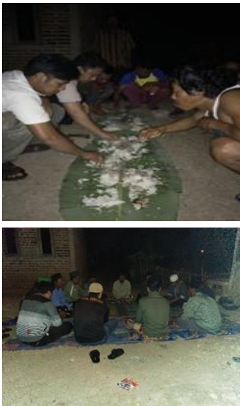
Fig. 3. Ngabungbang ceremonial process.

It is recommended to take ablution before the ceremony for self purification before the gathering and perform shalawat for prophet Muhammad SAW. After shalawat, they are discussing about their everyday problems and the best way to find solutions. Before the end of the ceremony, they reflect on the conflict between them, their mistakes and guilt before finally sending their gratitude to the creator. After completing all the processions, as closing event they do what is called papahare (eating together) as a form of gratitude for what they have, given by God, and also as a means to hold a conversation, something they lack doing during daytime because of their work in the fields.