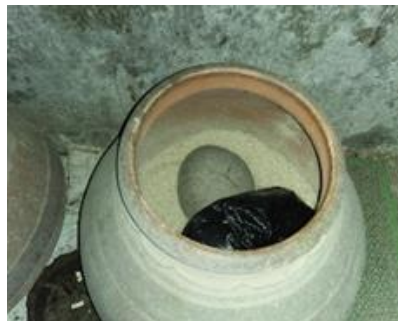
Fig. 2. Pandaringan as a container to put the offerings.

Culture is another main factor in determining the life and landscape of Kampung Salapan epitomized in ceremonies like Upacara Ngabungbang or Melekan and Upacara Mlipit or Nyalin. Those ceremonies are part of cultural life in Kampung Salapan. Upacara Ngabungbang or Melekan is routinely