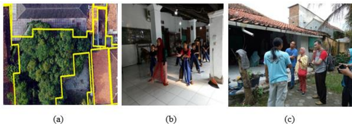
Fig. 2. The transformation of Kaputren . (a) Kaputren that has transformed into a cultural space, Sanggar Tari or dance studio [6], (b) The activity of learning Tari Topeng Gaya Slangit in the studio filled with enthusiastic young students [6], (c) Interview with the head trainer of Sanggar Tari Sekar Pandan [6].