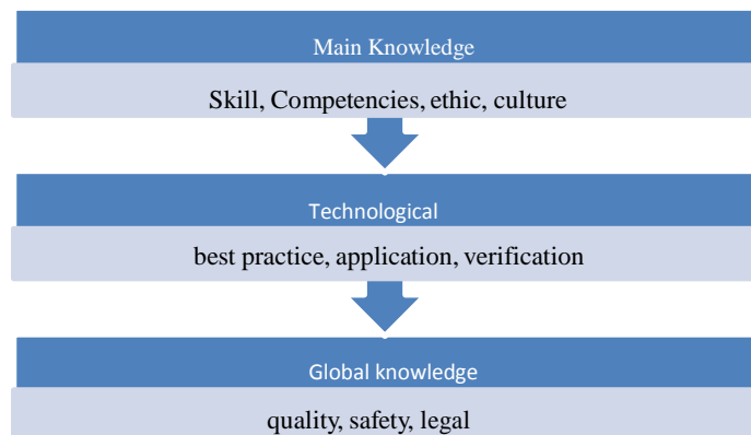
Figure 3 Migrant Worker KM Concept

Knowledge management in the context of the protection of migrant workers must be able to begin with the application of the right knowledge cycle. The most possible and simple knowledge management cycle starts with knowledge capture and/or creation, knowledge sharing and dissemination, and knowledge acquisition and application (Dalkir 2005). The knowledge that forms the basis of labor protection is the main knowledge as seen in figure 3. This is based on research conducted by Jose Llagunes regarding Clinical Knowledge Management at ICU (Llagunes 2018).