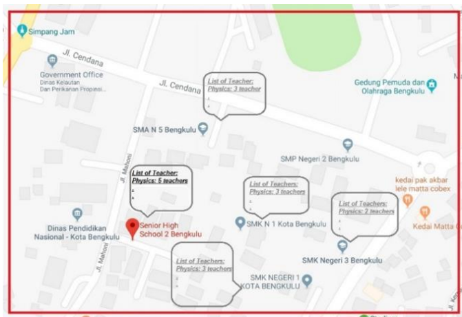
Fig. 2. Digitation process for teacher distribution in Bengkulu City.

be published in internet can also provide the real time information for public and internal development. The data that can be seen by public are about the school and the list of teachers available inside the current school. This information is one kind of development process to improve the understanding the need of the system inside the school.