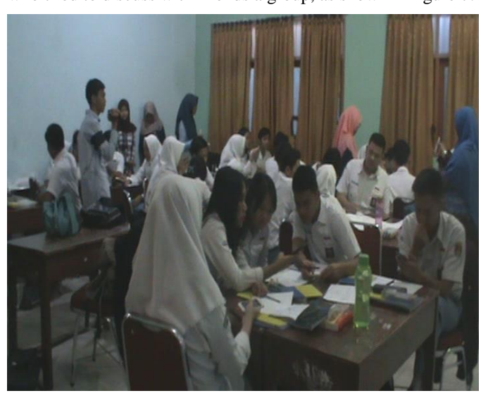
Fig. 7. Group discussion.

the teacher asks them to answer, they can answer correctly. Questions 3 and 4 are jumping task, because to answer this questions students are required to give reasons for the answers. Collaborative activity triggered by questions 3 and 4 turned out to be more. In general students have difficulty working on this task. In the group that we observed, it was seen that students initially tried to work independently, but there were students who tried to discuss with friends a group, as shown in figure 7.