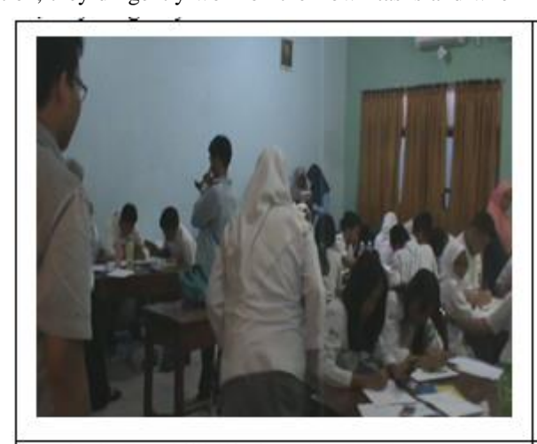
A. Trying to find information to other group.

Further collaborative activities can occur, as in the group we observe. When group discussions did not get results, there were students in the group who took the initiative to seek information from other groups. As shown in Figure 8A and the Figure 8B. After obtaining information, then return to the group to discuss it with a group. When they were still not finished, they also returned to the other group, until they are sure of their answers.