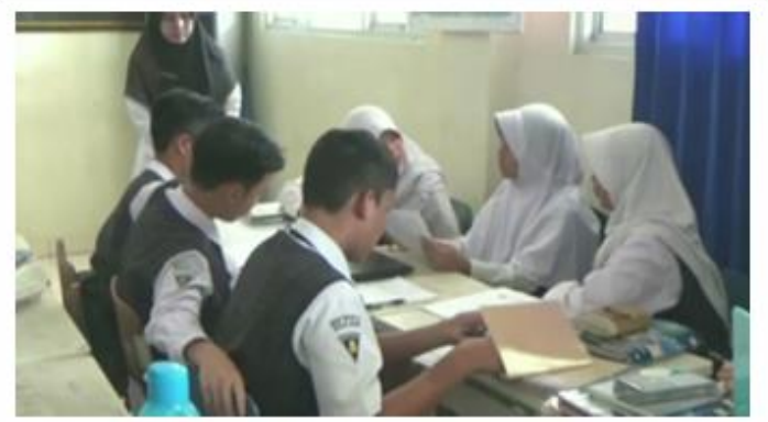
B. Ask each other.