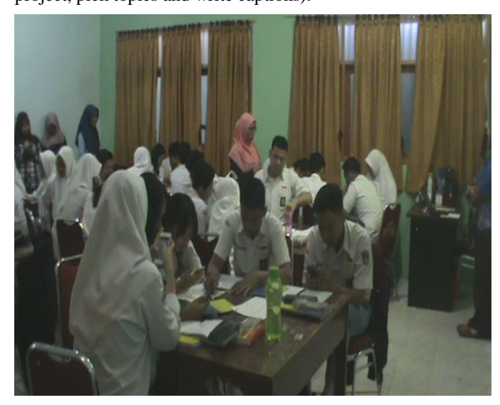
Fig. 6. Independent activity to find information.

There are four questions related to the "caption" material, namely: 1. where do we find captions?(Find many captions in English); 2. What is the caption? (Observe and browse the suggested media (they are divided into social media groups, magazine groups, book groups, and video groups, recognize captions in daily use in English); 3. How do people write captions? (Show their captions choose the captions they understand mostly and the ones they do not understand, analyze the structure of captions); what are the functions of caption? (Inform the class of caption, present some captions they want to post (school trip, business promotion, book project, pick topics and write captions).