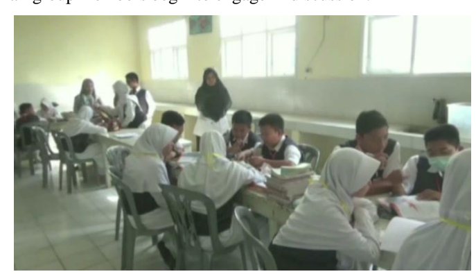
Fig. 3. Discussion activity on jumping tasks.

For question number 3 (Based on Table 1, when is the work is zero? Explain!) And question number 4 (Based on Table 1, why does the object stop, just before moving?) are jumping task. Because to answer questions 3 and 4 students are required to give reasons for the answers. To answer this type of task, students need a discussion with a group of friends. When answering questions number 3 and 4, collaborative activities conducted by students are more numerous (figure 3). The students generally have difficulty on this task, and then try to finish on task independently first, but in general students in groups class cannot complete their own tasks. Therefore, it was not so long that they immediately discussed. A number of groups, it turned out when they had difficulty, then discussed with each other. At first time, they were trying to work independently (figure 4A), but there were one or two students in the group who started asking friends to discuss (figure 4B). When they had not found the answer, then they began searching for various sources of information such as books and the internet (figure 4C). Collaborative activity increases when all group members begin to engage in discussion.