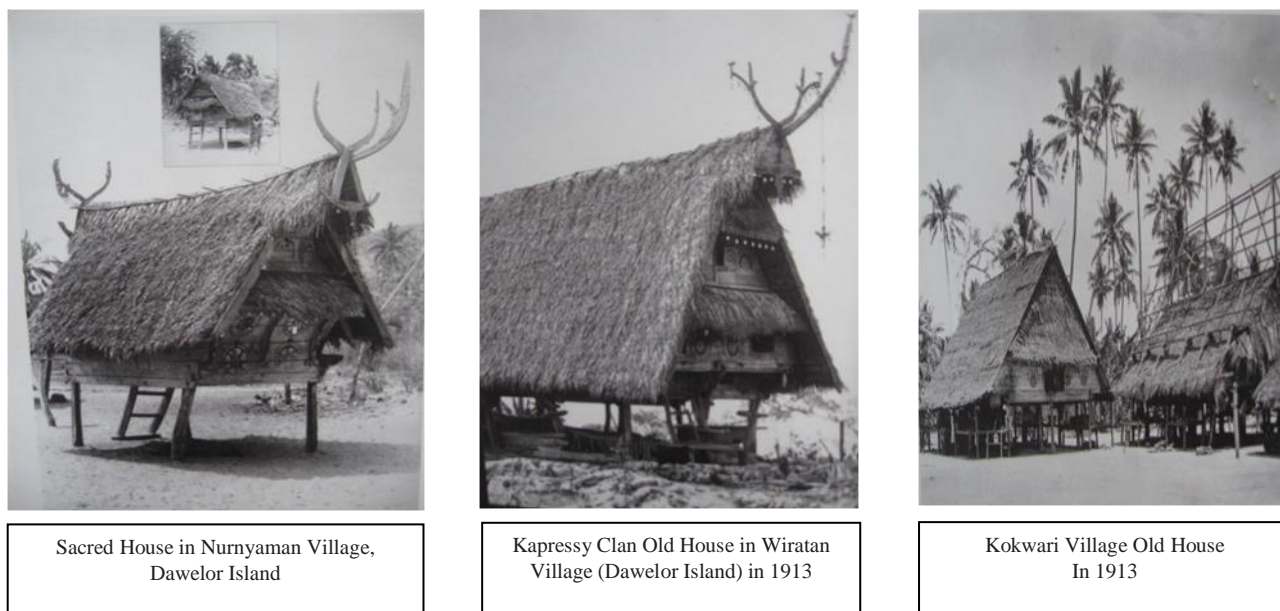
Fig. 1. Traditional Houses of Several Villages in the Babar Archipelago [9]

One of the traditional house constructions in the village of Telalora is in the form of a stilt house, which is refuted or built on several poles. There are three (3) important parts of Im , namely the bottom, middle and top. Each part of the building has its own name and function. Characteristics of traditional house building Im can be seen in the following figure 1.