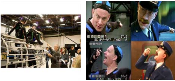
(Fig3) make Polar Express production process

The Polar Express is a complete CG animation film using motion capture from beginning to end for the first time, which also achieves body motion capture and face performance capture jointly for the first time. For this reason, this film has been recorded in Guinness World Records (2006). And at the same time, at the site of shooting The Polar Express, there are more than 60 video cameras, calculating and capturing body performance and face performance of several actors at a time, which achieves the animation character whose motion is most close to real person.