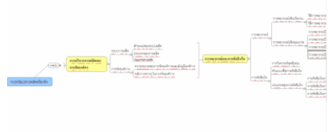
Fig. 1: display Concept chart and Content Network Analysis by MindMap

5.1 e-Learning development for Fundamental Production Management consist of 8 fundamental contents: 1) Administration and management of organization, 2) Forecasting and Decision, 3) Capacity Planning, 4) Fundamental production location, 5) Production process layout, 6) Planning and scheduling, 7) Production costs control, 8) Inventory control.