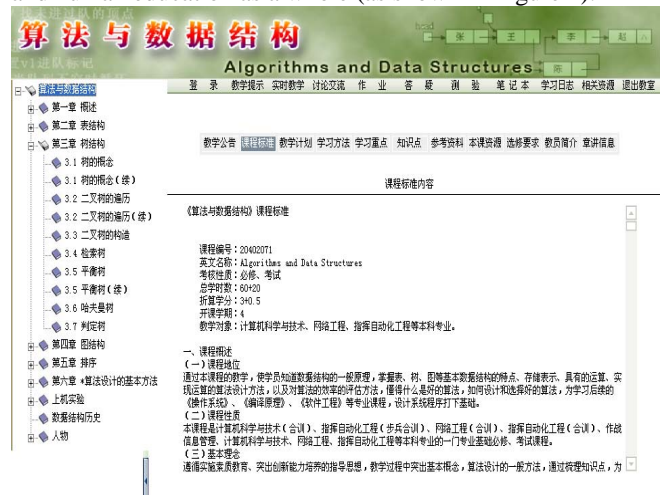
Fig 1 algorithms and data structures network course

Algorithms and data structures network curriculum use modern network programming techniques to build, which provides an open, interactive, flexible, rich cube teaching environment. Algorithms and data structures network course including Web, video teaching materials, algorithms animation, exercises, FAQ, notebook, homework, automatic test paper generation, auxiliary teaching books, teaching reference books, data structures development history and characters, which collect scientific knowledge and human education as a whole (as shown in Figure 1).