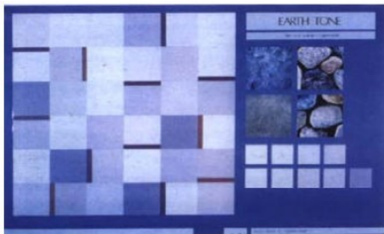
Figure 1: Natural extract from the surface of the material color Resource: [5]<Word Architecture> 2003.9

Architecture art is a new subject. It plays a significant role in environmental planning design and also gives a help to human life to make urban planning more humane as well. So architecture art is a good form of visual art. Architecture color design can achieve the desired results by sophisticated design, building materials and color of choice. This is a comprehensive and the complexity of work. The designers can extract naturally from the surface of materials and colors. This element can be used flexibly into the architecture color design.