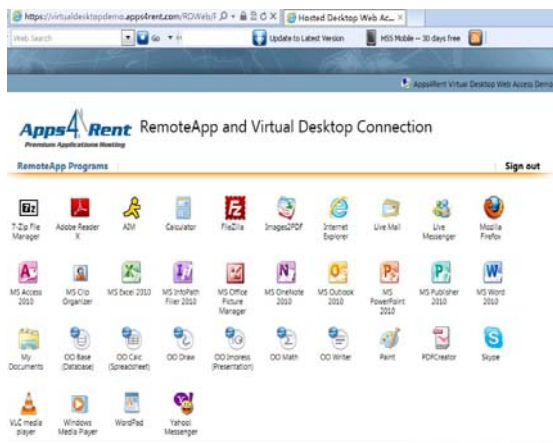
Fig.1. Different applications with SaaS model