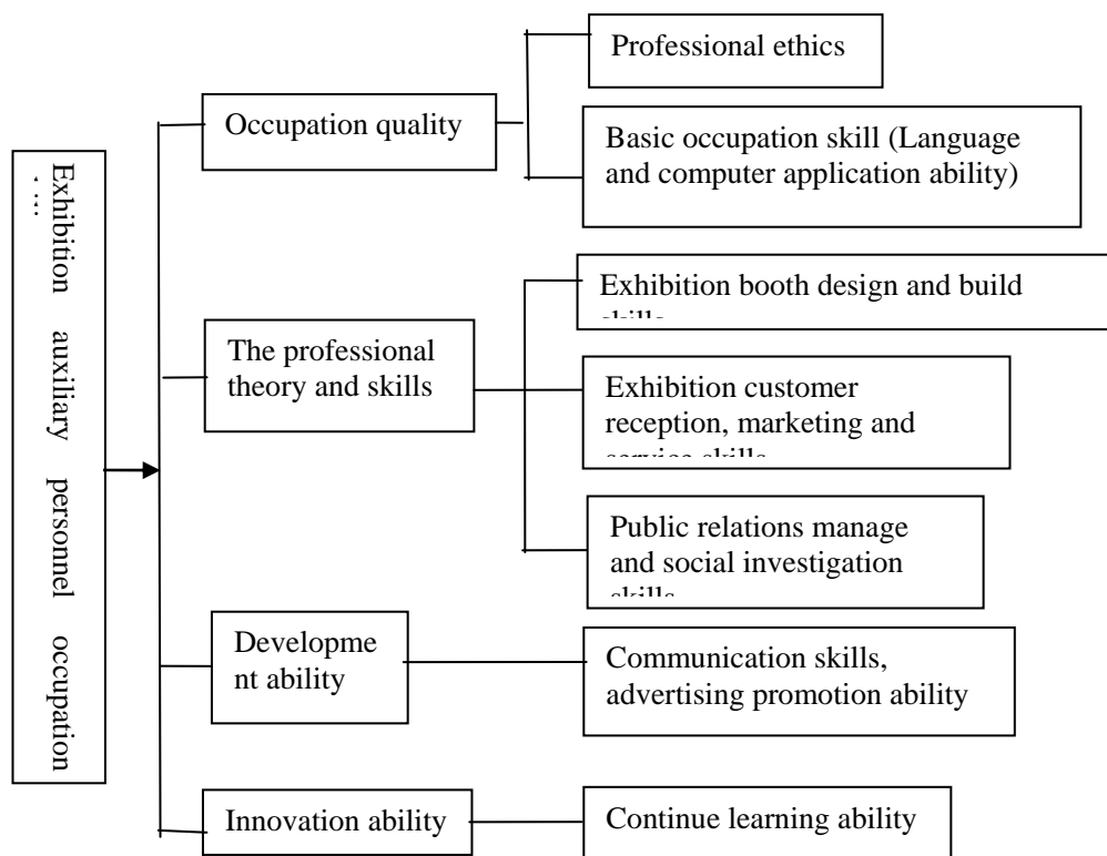
Fig.2 Mode of multiple intelligent talents training of exhibition occupation education